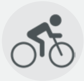
Cycle To Work Scheme .....