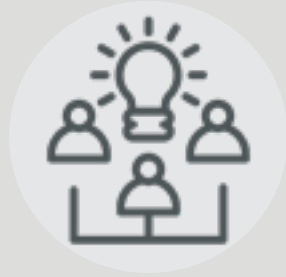
An Annual Foundation Wide CPD Conference .....