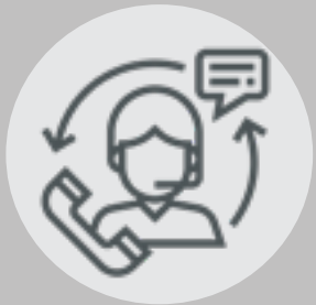
Employee Assistance Programme .....