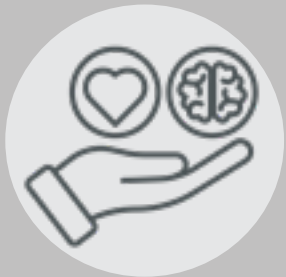
Education Staff Wellbeing Charter .....