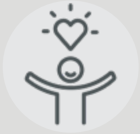
Suite of Family Friendly, Wellbeing and EDI Policies .....