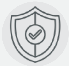
Supervision for DSLs .....