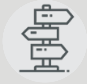
Careers Pathways .....