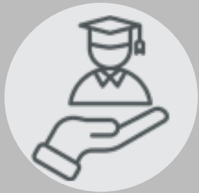
Funded CPD and Apprenticeship Programmes .....

“ 14 schools and central team of professional experts, with over 2,000 staff in total. ”