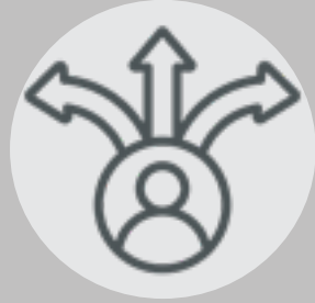
Secondment Opportunities .....