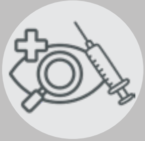
Free Eye Sight Tests and Flu Vaccinations .....